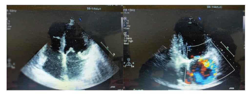
Fig. 5 Myxomatous mitral valve with anterior mitral leaflet prolapsed, and severe eccentric mitral regurgitation.

obtuse angle.<sup>9</sup> Wormian bones are present in calvaria. The clavicles are small at the time of birth; during childhood, they may disappear because of osteolysis and fibrosis. Ribs are fragile and the bilateral posterior part of the upper four ribs may disappear in early childhood.<sup>10</sup> Skeletal deformity includes coxa valga, and acro-osteolysis may develop.<sup>11</sup>