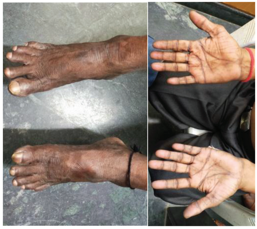
Fig. 3 Hyper pigmentation and clubbing of feet and hands.