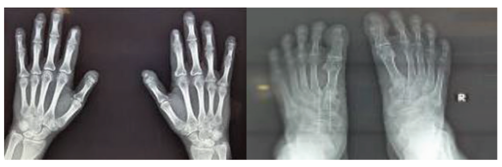
Fig. 2 Showing acral osteolysis of both fingers and toes.

prominent nose with parrot beak appearance, thin upper lip, large, low-set ears, periorbital hyperpigmentation, micrognathia, retrognathia, acral osteolysis of fingers and toes ( -Fig. 2 ), hyperpigmentation over lower abdomen/both feet and hands, and clubbing ( -Fig. 3 ).