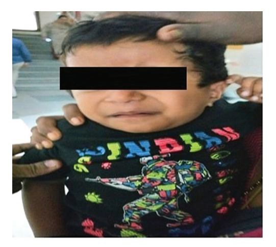
Fig. 1 Facial features of the patient which is not suggestive of any syndromic appearance.

Fig. 2 The apical five-chamber view of echo is showing cardiac muscle hypertrophy with left ventricular outflow tract obstruction.