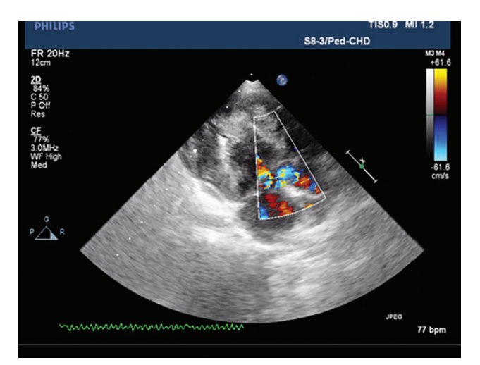
Fig. 3 Plax view showing left ventricular outflow tract obstruction.