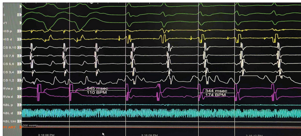
Figure 4: Entrainment during tachycardia: On cessation of ventricular pacing, the post-pacing interval minus tachycardia cycle length was 201 ms which is higher than 115 ms. This goes in favor of atrioventricular nodal reentry tachycardia (AVNRT). Further, the delta ventriculoatrial during V pacing and during tachycardia are more than 85 msec, favoring the mechanism to be AVNRT. Repetitive Entrainment episodes via V pacing during the Tachycardia documented VA linking, thus make sAT unlikely.

Radiofrequency modification of the slow pathway was done. Procedure was completed without any complication and he was discharged the next day.