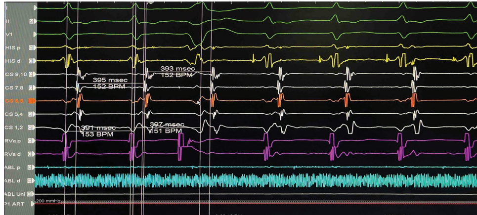
Figure 3: His synchronous premature ventricular contraction (PVC): The His synchronous PVC failed to reset the tachycardia as the tachycardia cycle length in the atrial electrogram is unchanged. Atrioventricular reentry tachycardia is less likely to be the mechanism.