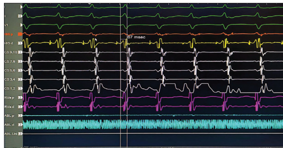
Figure 2: Tachycardia induction in the electrophysiological laboratory: Septal ventriculoatrial <70 ms is suggestive of typical atrioventricular nodal reentry tachycardia.

This is an open-access article distributed under the terms of the Creative Commons Attribution-Non Commercial-Share Alike 4.0 License, which allows others to remix, transform, and build upon the work non-commercially, as long as the author is credited and the new creations are licensed under the identical terms. ©2024 Published by Scientific Scholar on behalf of Indian Journal of Cardiovascular Disease in Women