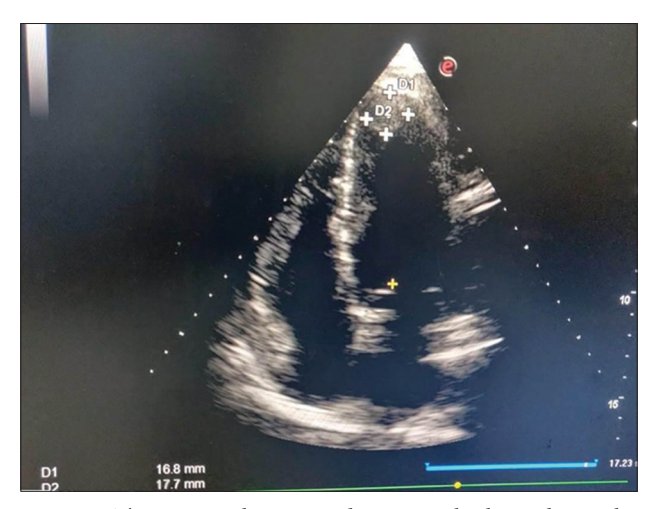
Figure 1: This picture shows two-dimensional echocardiography (apical four-chamber view) with the left ventricular thrombus attached to the apex and measured 17 \times 18 mm.

The primary outcome measure was the efficacy of rivaroxaban compared to nicoumalone in the management of LVT. This was assessed by monitoring the thrombus resolution and any recurrence of thrombus during the study period. Secondary outcome measures included the incidence of adverse effects such as bleeding events and stroke in both treatment groups.