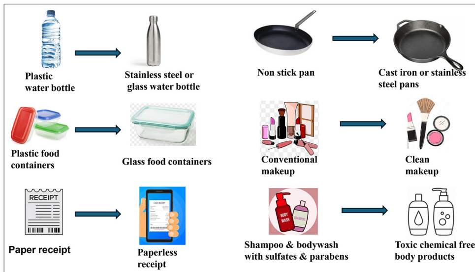
Figure 3: Easy endocrine disruptor swaps in daily life.