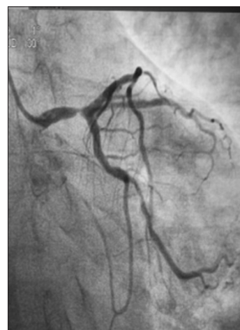
Figure 5: 7F and LMCA Intervention