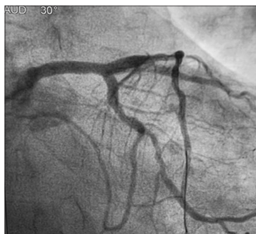
Figure 6: 7F and ulnar route.