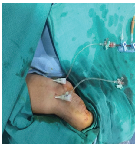
Figure 3: Same side ulnar route after an abandoned radial.