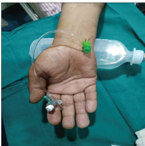
Figure 2: The ulnar route.