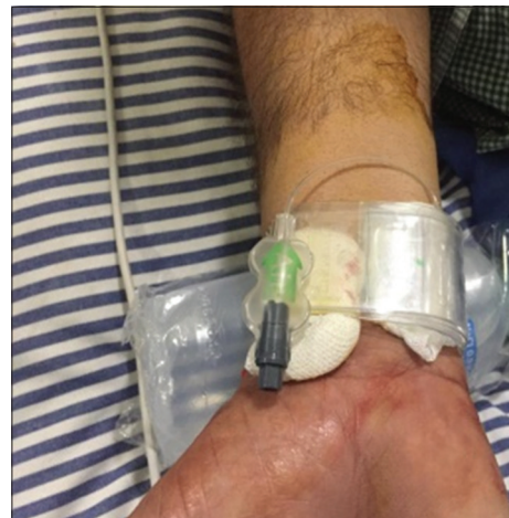
Figure 4: Same side ulnar hemostasis.