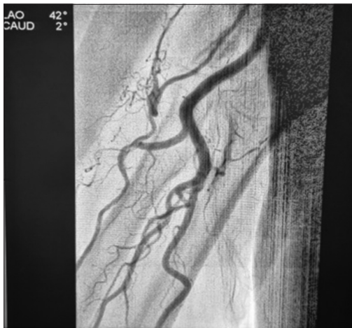
Figure 1: The concept of arterial dominance.