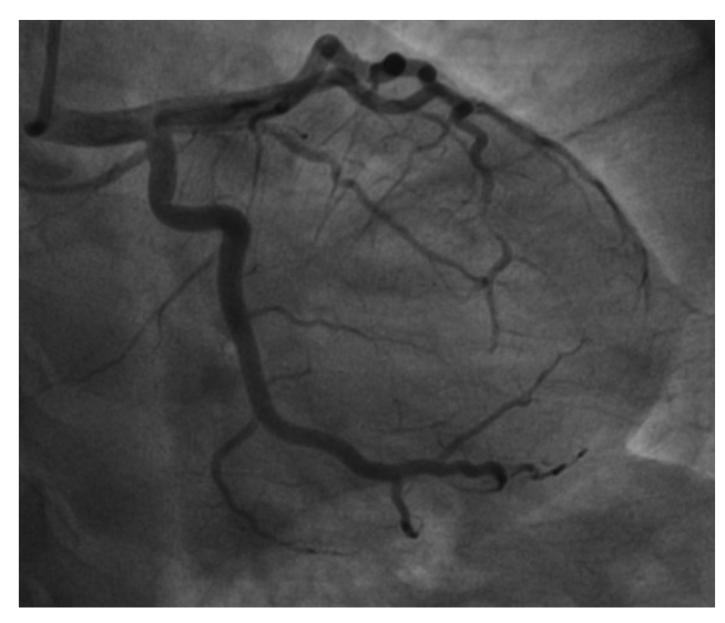
Fig. 3 Repeat angiogram of the same patient showing cleared thrombus in LCX and OM after GP 2b 3a infusion. Abbreviation: Abbreviations: OM, obtuse marginal artery; LCX, left circumflex artery.