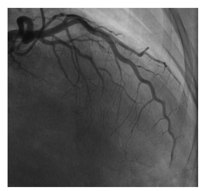
Fig. 4 Repeat angiogram showing still showing there is a mild distal LAD thrombus. Abbreviation: LAD, left anterior descending.

patent foramen oval. On evaluation, the patient was found out to have normal homocysteine, antithrombin, protein C, protein S levels, negative for Factor V Leiden and prothrombin mutation, and normal thyroid levels. The patient was clinically anemic with hemoglobin of 7.8 g/dl, and iron profile showing iron-deficiency anemia picture. Serum prolactin was 90.34 ng/ml and repeated prolactin levels after 6 weeks were 67.65 ng/mL, both values were higher than normal for her age and condition, without clinical signs prolactinomas. The patient was advised MRI of the brain to look for pituitary tumors but the patient did not undergo the procedure, and in this case, either elevation of prolactin could be a cause of the multiple coronary thromboses, and microadenoma of the pituitary maybe a cause of raised prolactinomas.