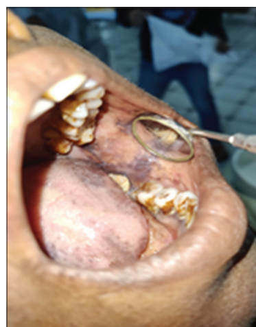
Figure 2: Lichenoid lesion in a hypertensive adult.

The most common symptom noted in hypertensive patients in our study was dryness of the mouth (60%) whereas a study by Kumar et al. [6] had reported hyposalivation in 16.9% and Elmi Rankohi et al. [7] in 40% of patients. The reported differences can be attributed to differences in the parameters which were used to assess salivation and the effect of pharmacotherapies, predominantly diuretics in different study groups. The dryness of mouth was reported more in higher age groups whereas no significant correlation was found between age and other periodontal findings. The