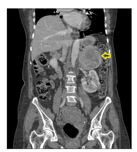
Figure 2: Computed Tomography of the abdomen showing a large left adrenal mass (indicated by yellow arrow).