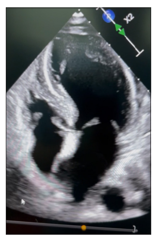
Video 1: Echo at showing apical dilatation and left ventricular dysfunction suggestive of Takotsubo cardiomyopathy.

Pheochromocytoma, a rare neuroendocrine tumor arising from chromaffin cells, poses significant diagnostic challenges due to its highly variable clinical presentation. These tumors secrete excessive catecholamines, leading to diverse cardiovascular manifestations such as hypertension, tachycardia, myocardial infarction, and cardiomyopathies, including TCMP. This discussion synthesizes relevant