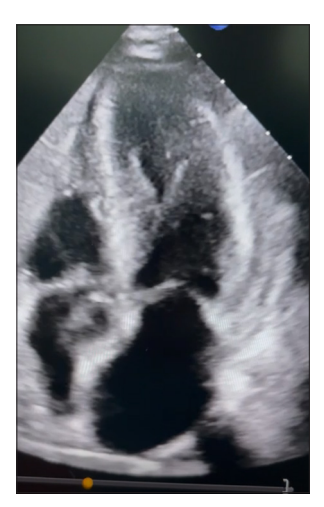
Video 2: Echo after 1 week showing normalization of previous echo findings.

literature while contextualizing the diagnostic journey of our patient, emphasizing the critical need for heightened clinical suspicion in atypical presentations.